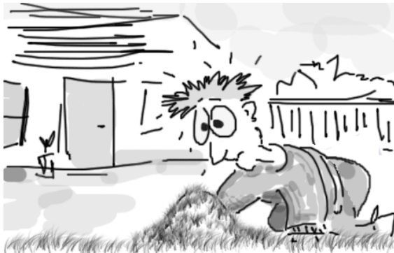
Earls worst fears were confirmed when he found the first signs of an emerging church in his back yard.

(2 Thessalonians 2:3) "Let no one deceive you by any means; for that Day will not come unless the falling away comes first, and the man of sin is revealed, the son of perdition,"