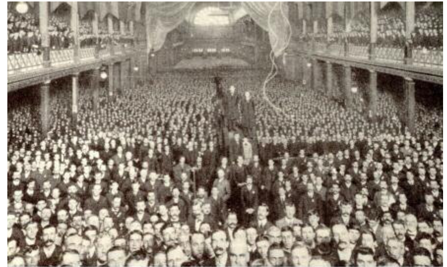
Men's service, Melbourne Exhibition Building, 1909.

(2 Chronicles 7:14) ""if My people who are called by My name will humble themselves, and pray and seek My face, and turn from their wicked ways, then I will hear from heaven, and will forgive their sin and heal their land."