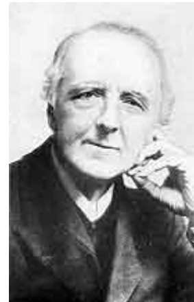
F B Meyer

(Ephesians 4:32) "And be kind to one another, tenderhearted, forgiving one another, just as God in Christ forgave you."