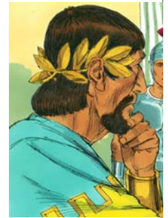
Herod Agrippa I

(John 21:18) "'Most assuredly, I say to you, when you were younger, you girded yourself and walked where you wished; but when you are old, you will stretch out your hands, and another will gird you and carry you where you do not wish.'"