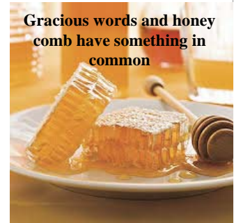
Gracious words and honey comb have something in common

(Colossians 4:6) "Let your speech always be with grace, seasoned with salt, that you may know how you ought to answer each one."