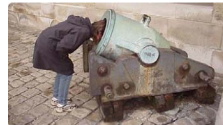
Are you looking in the wrong places for satisfaction in life?

(Psalms 119:174) "I long for Your salvation, O LORD, And Your law is my delight."