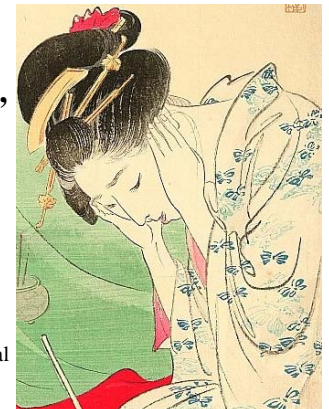
1900 Japanese revival