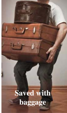
Saved with baggage

(2 Timothy 1:5) "when I call to remembrance the genuine faith that is in you, which dwelt first in your grandmother Lois and your mother Eunice, and I am persuaded is in you also."