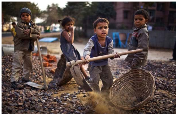
Dalits of India

(John 1:46) "..., "Can anything good come out of Nazareth?" ... ""