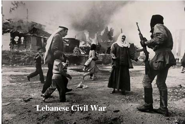
Lebanese Civil War