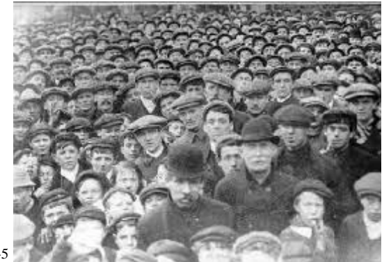
Welsh revival 1904-5