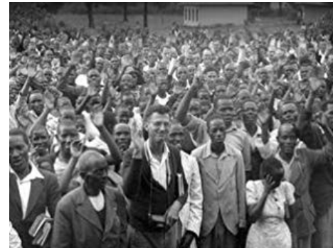
East African revival, 1930's

(Numbers 9:11) "On the fourteenth day of the second month, at twilight, they may keep it. ..."