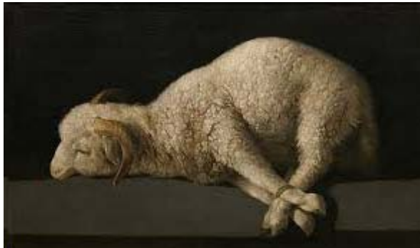
The blood of the Lamb is at the heart of worship