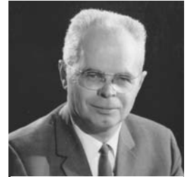
J Edwin Orr

(Romans 1:24) "Therefore God also gave them up to uncleanness, ...,"