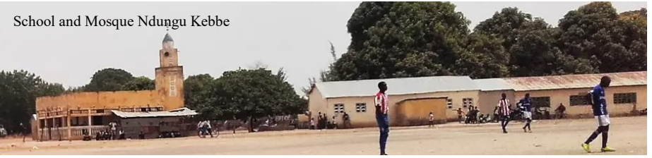
School and Mosque Ndungu Kebbe

5. Counterfeits do not understand _____, verses 50-52, 56-59,