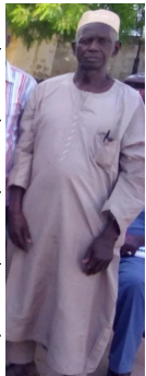
"I know God"

1. Counterfeits claim to _____, verses 41, 54