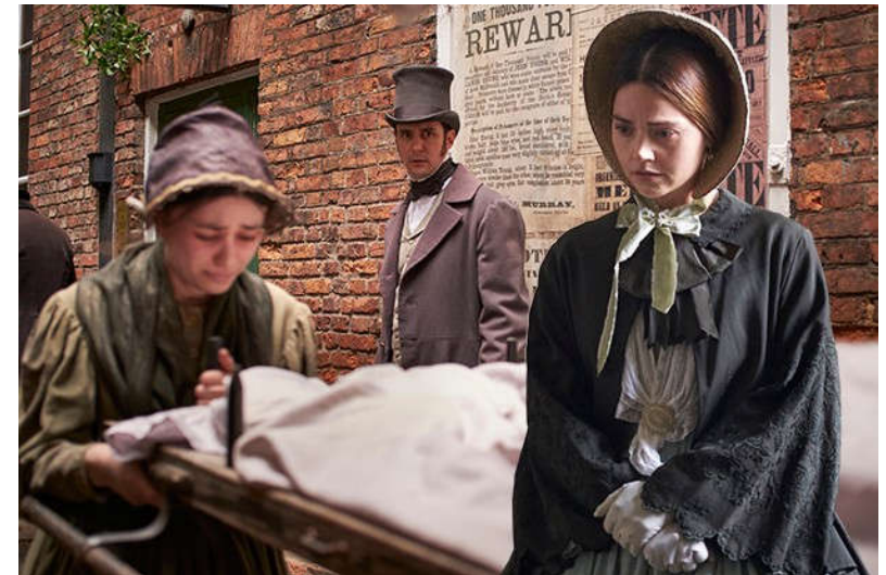
London Cholera outbreak

(2 Corinthians 7:1) Therefore, having these promises, beloved, let us cleanse ourselves from all filthiness of the flesh and spirit, perfecting holiness in the fear of God.